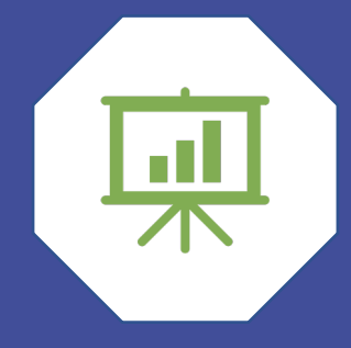
TRANSACTION DUE DILIGENCE